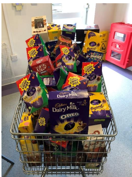
EASTER EGGS READY TO BE INCLUDED IN OUR ENRICHMENT HAMPERS, ALL DONATED BY TESCO BILLINGHAM.